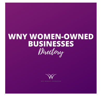
Help for women-owned businesses facing unprecedented challenges – WBFO

Check out all our latest news on our News Page .