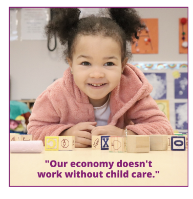
Child care providers face challenges before they reopen – WKBW Channel 7

Bringing to light the barriers women face!